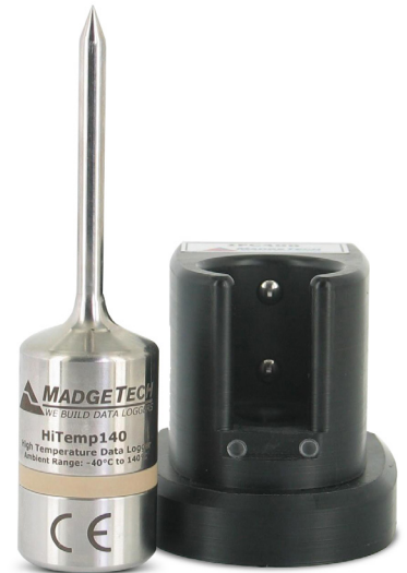
IFC400 (sold separately)

Using the MadgeTech Software, starting, stopping and downloading the HiTemp140 is simple and easy. To use, simply place the HiTemp140 in the IFC400 or IFC406 docking station (sold separately). Using the software, an immediate or delay start can be chosen, as well as the reading rate. Start the data logger, remove it from the docking station and the device is ready to be deployed. Graphical, tabular and summary data is provided for analysis and data can be viewed in °C, °F, K or °R. The data can also be automatically exported to Excel® for further calculations.