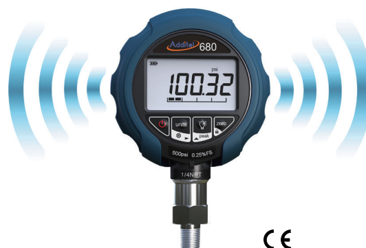
680 with data logging and wireless (optional)